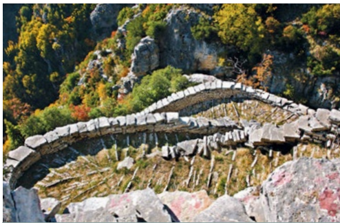
VRADETO LADDER ZAGORI, EPIRUS